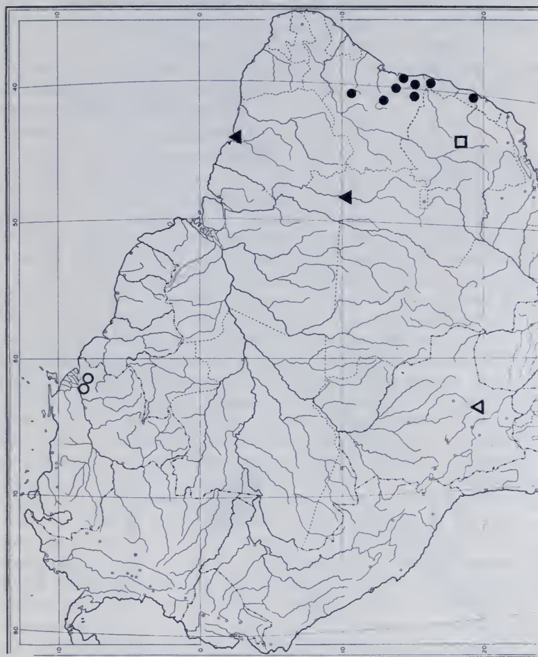
FIG. 6. Geographical distribution of new taxa described: ○ Brunfelsia inatacana . ▲ B. burchellii . ● B. claudestina . □ B. rupestris . △ B. boliviana .